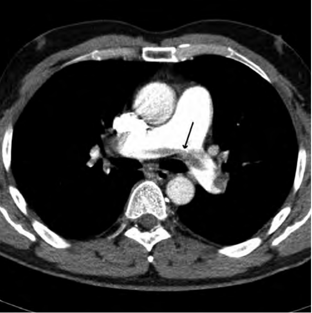
Figure 3 Within the area of pulmonary trunk fork (forking to the right and left of the arteria pulmonalis) an oblong area of tissue density causing loss of contrast is visible which is symptomatic of large thrombus – the "rider" type embolus.

The Pearson linear correlation coefficients of Quanadli index and the other evaluated parameters in patients are presented in Table 4.